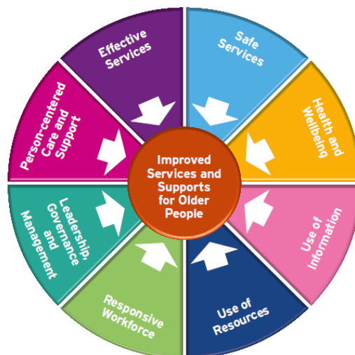
Figure 1: Themes in the National Standards

Each section is made up of four themes which are set out in full in the national standards for older people in Ireland which are available on our website, www.hiqa.ie . The standards are then written against each theme.