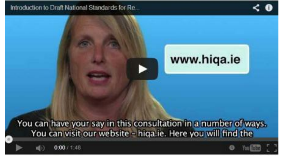
To view our YouTube video on the draft standards, click here.

We have launched a nationwide public consultation on draft revised standards for nursing homes and residential care settings providing services to older people.