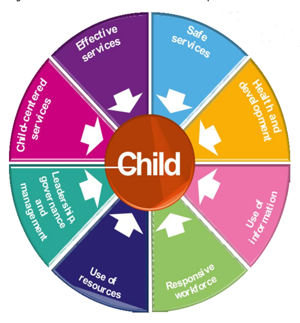
Figure 1: themes in the National Standards for Special Care Units